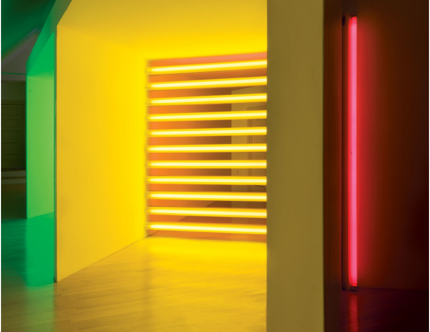
Dan Flavin nine sculptures in fluorescent light, 1963–81

Dia Bridgehampton The Dan Flavin Art Institute 23 Corwith Avenue Bridgehampton, New York